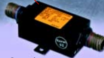
Low Speed Warning Detector